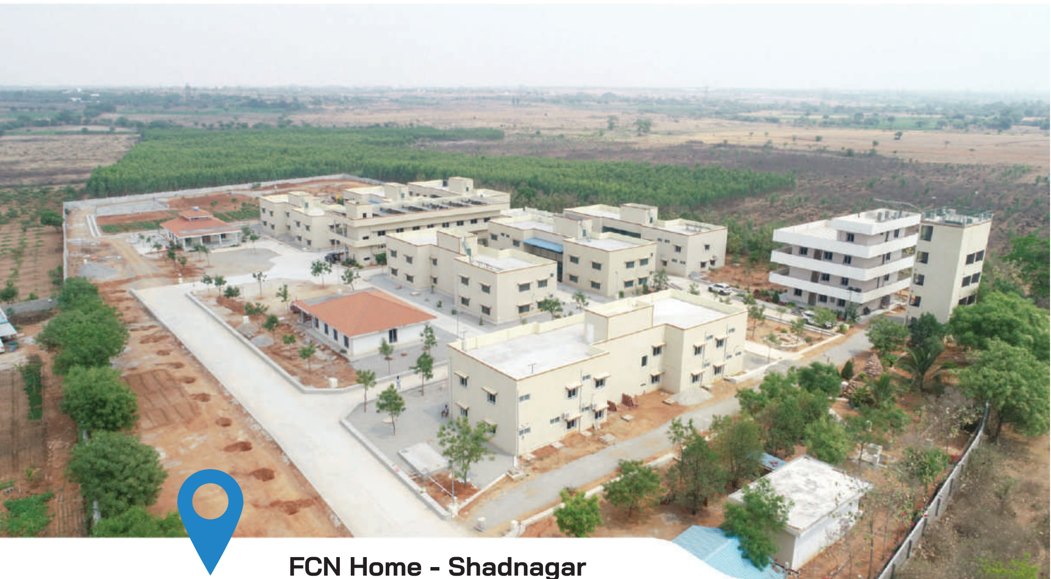
FCN Home - Shadnagar