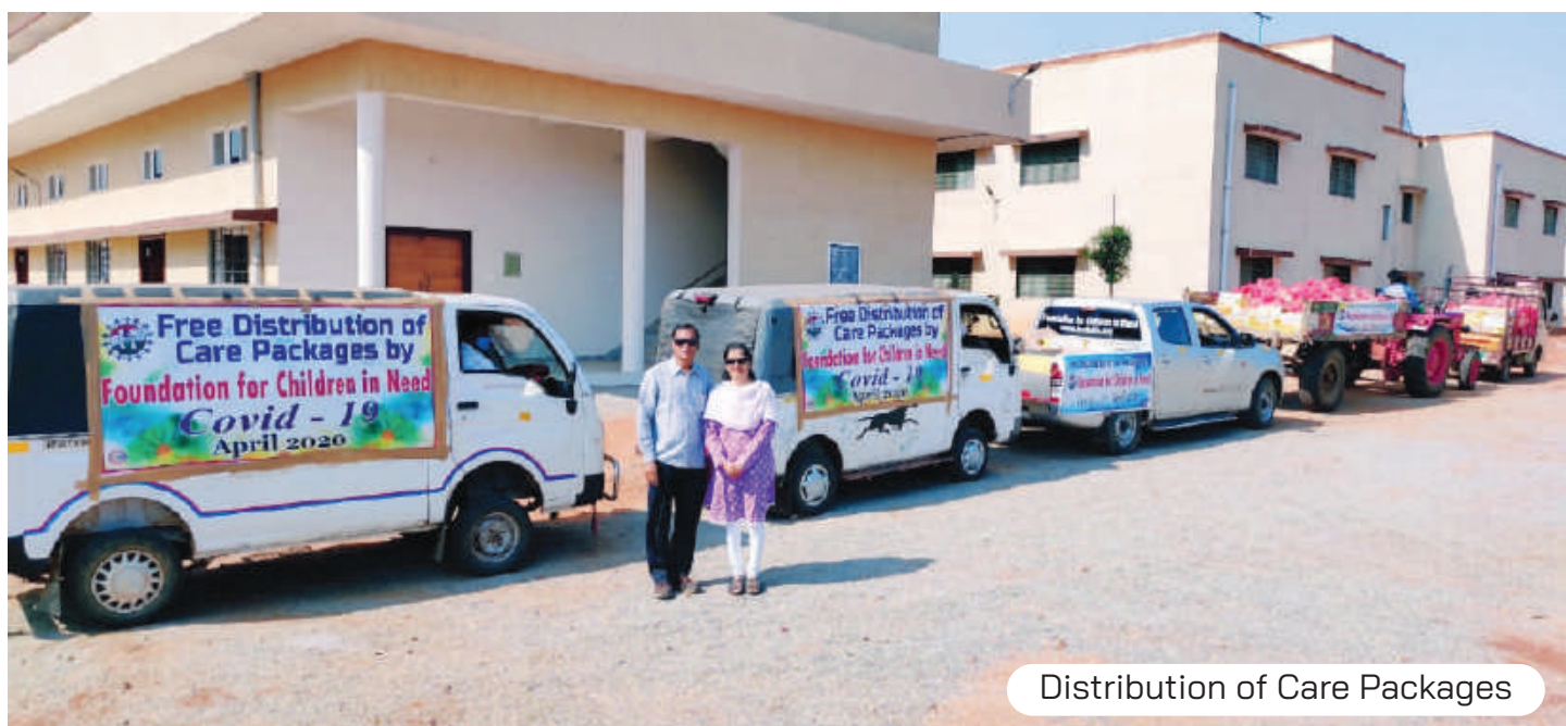
Distribution of Care Packages

Provided 3700 care packages and 34000 masks and 7000 sanitizers to immigrant workers and needy families.