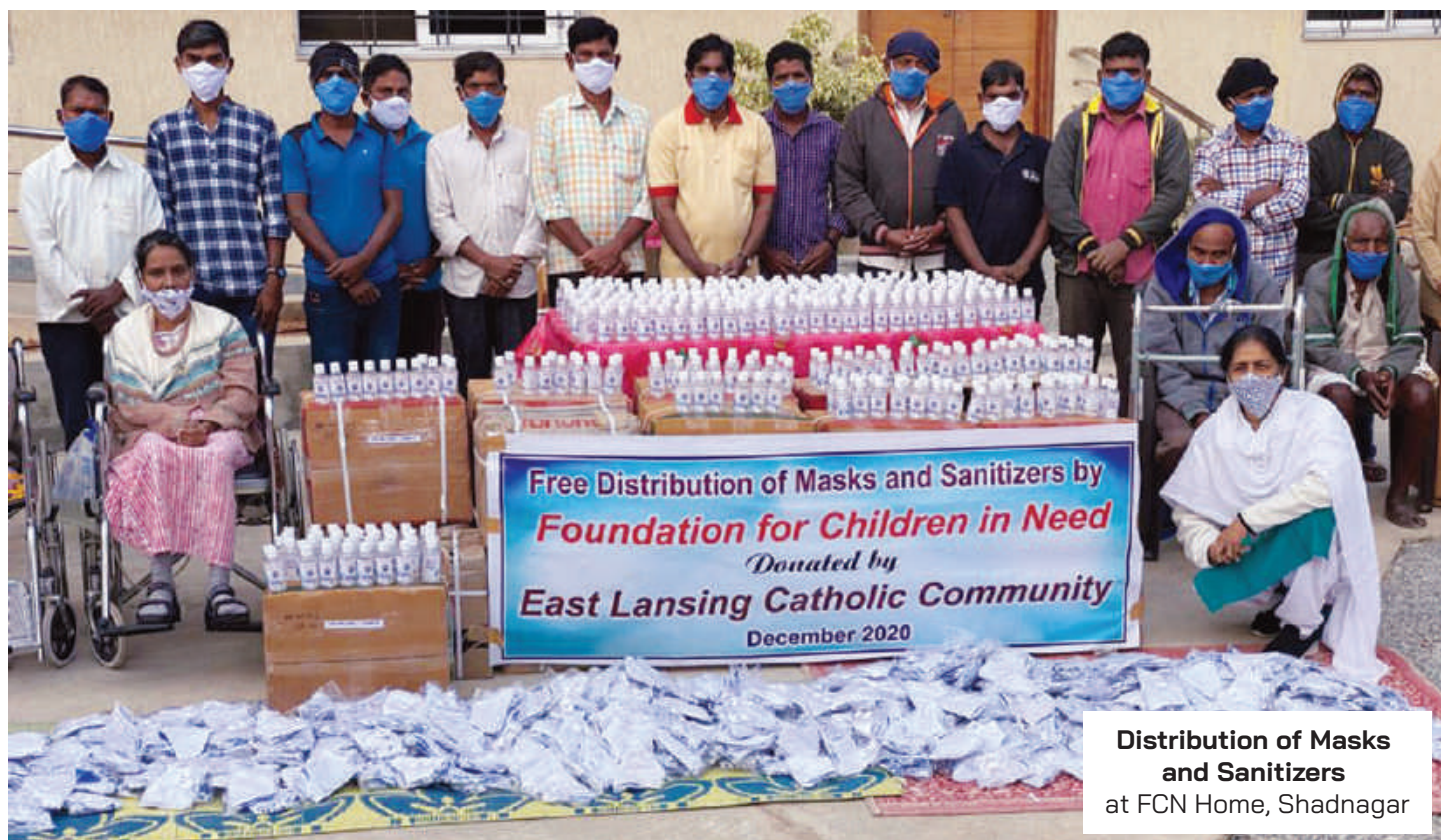
Distribution of Masks and Sanitizers at FCN Home, Shadnagar