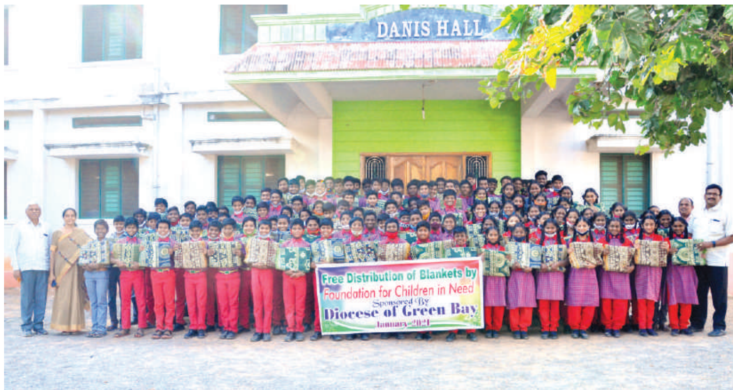
C.S.R.M. High School, Akkalareddypalle

FCN has distributed 500 blankets to the students of Chitta Showry Reddy Memorial School. They are happy for it and thanked the FCN donors.