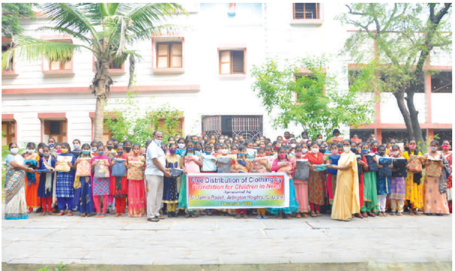
St. Joseph's Girls High School, Mariapuram