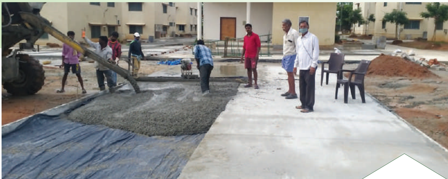
Laying CC Roads