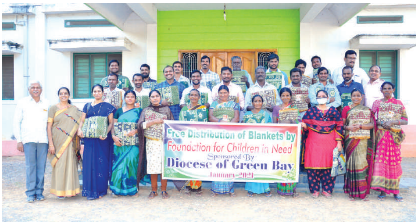
C.S.R.M. High School Staff, Akkalareddypalle