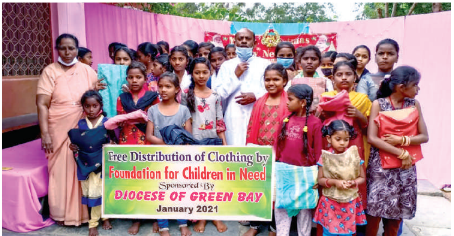
Immaculate Convent, Urutur