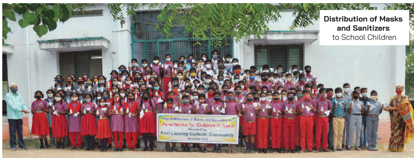
Distribution of Masks and Sanitizers to School Children