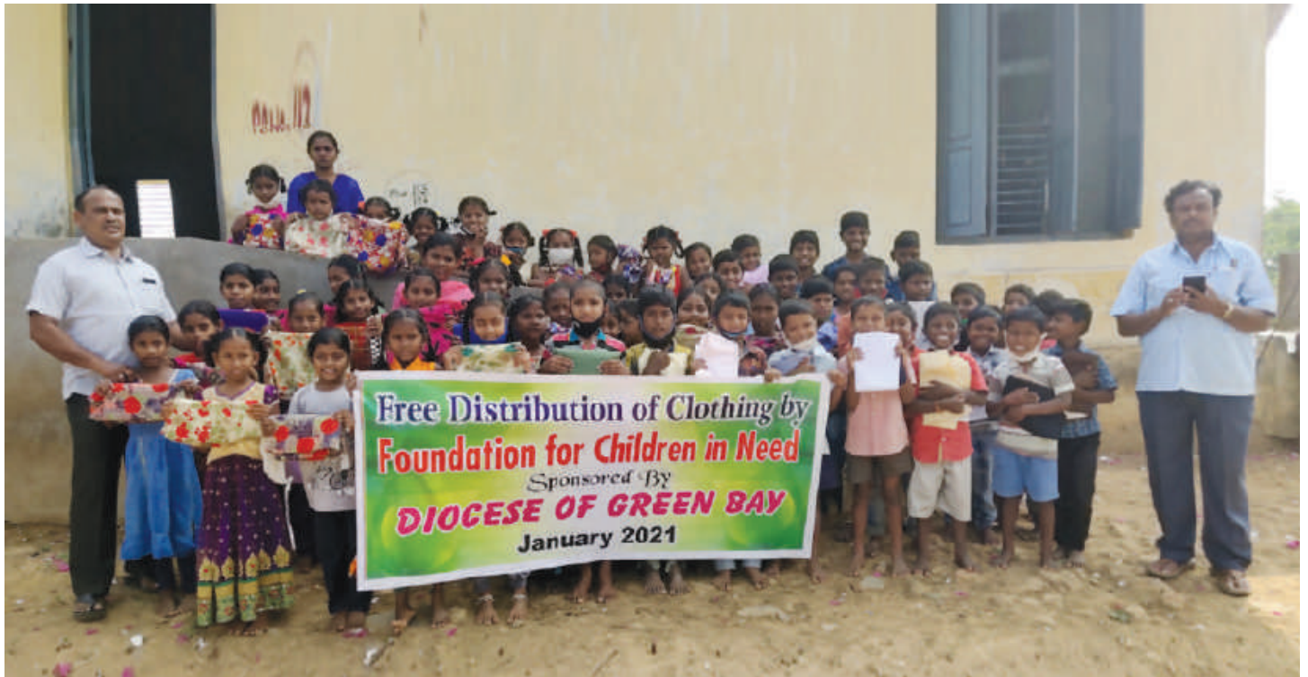
R.C.M. Primary School, Konarajupalle

FCN has distributed new clothing to 1825 children of different schools nearby Porumamilla. The school management expressed their gratitude and happiness for the service to the needy. They all specially thanked the FCN donors.