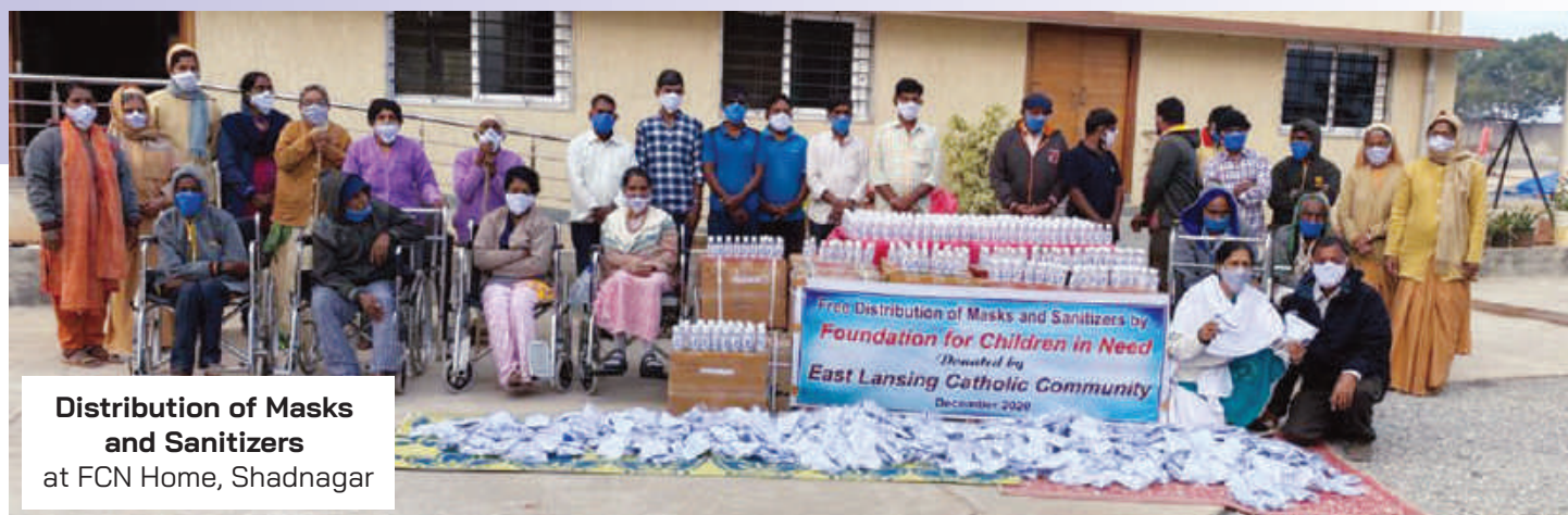
Distribution of Masks and Sanitizers at FCN Home, Shadnagar